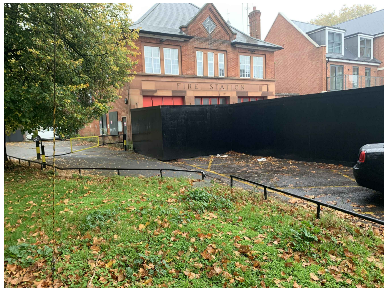
EXISTING HOARDING TO BE PAINTED DARK GREEN ALL ROUND