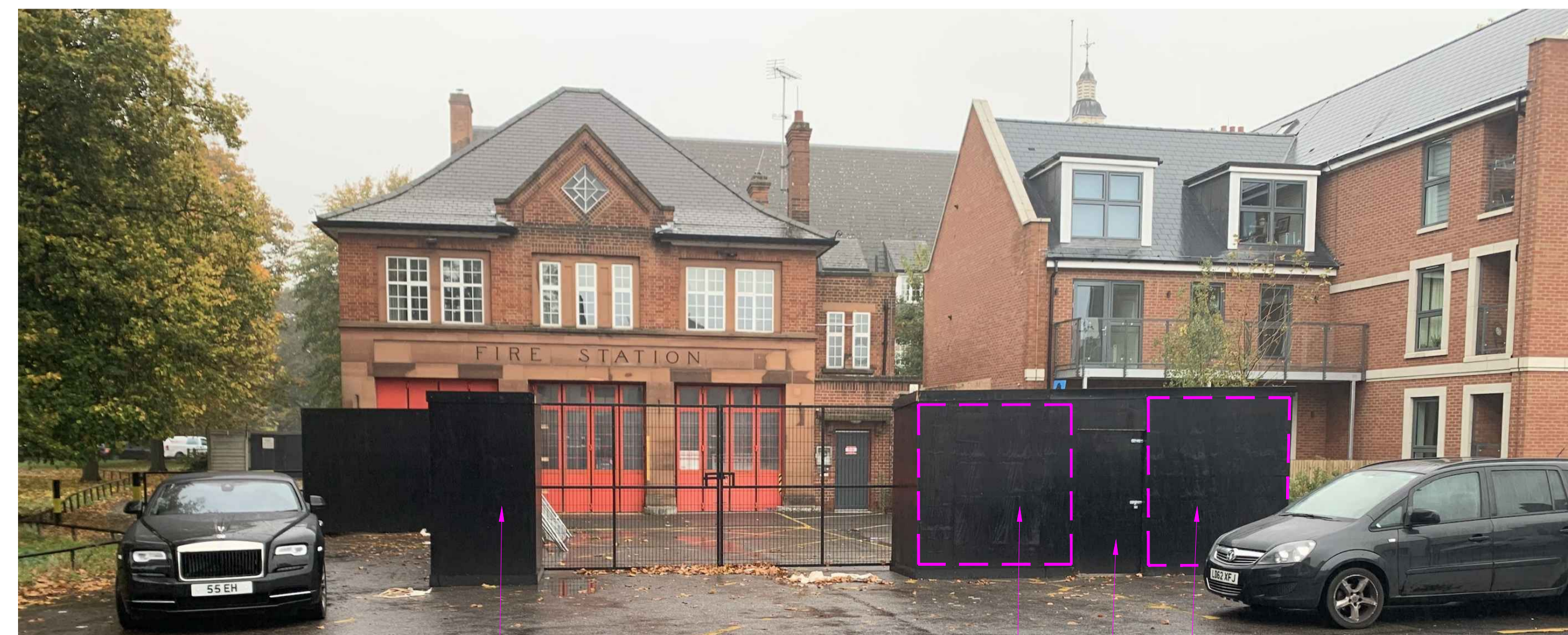
NEW TEMPORARY HOARDING PAINTED DARK GREEN (RAL 6028) ALL ROUND